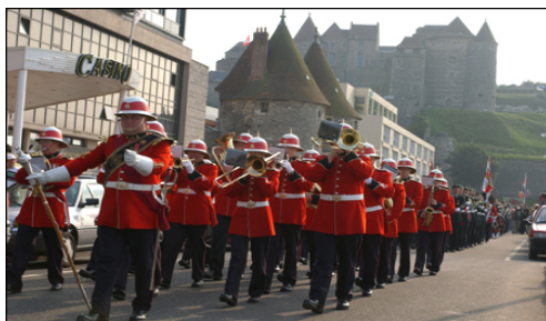
The RHLI Band, seen here in 2002, lead the 60th Anniversary Celebration Parade in Dieppe, France.